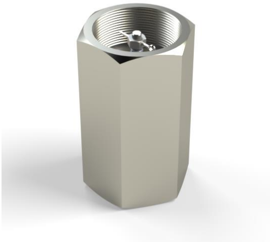
Figure 1: Valve Photo